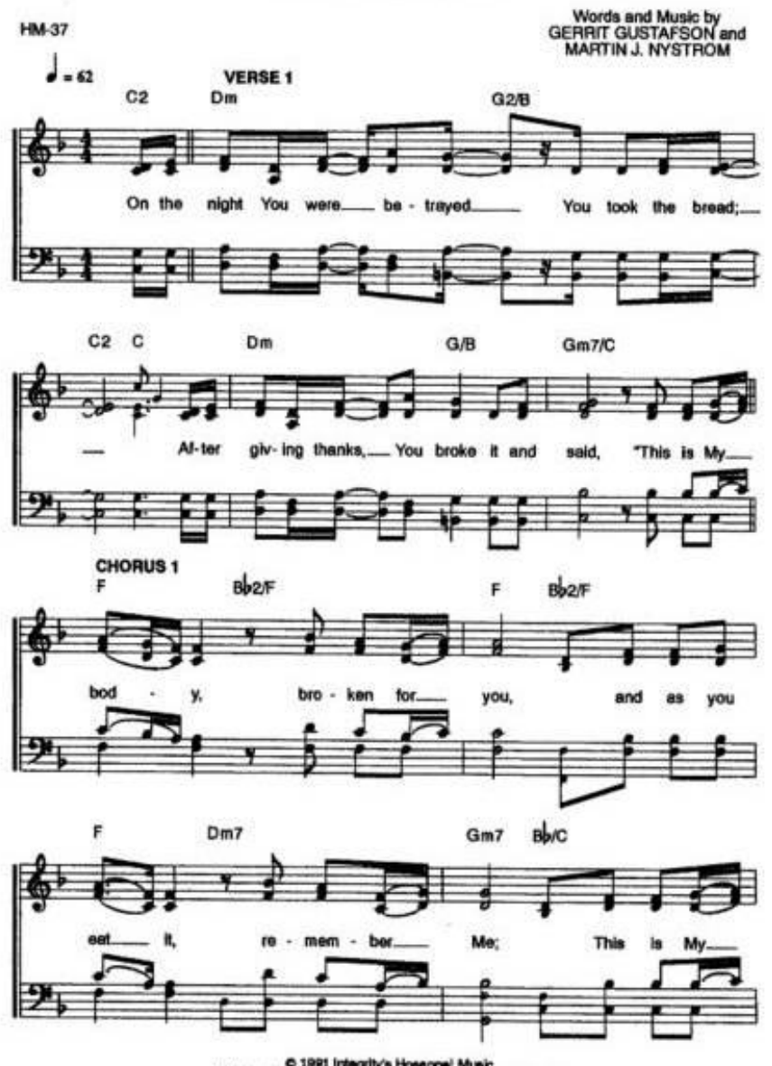
C 1991 Integrity's Hosenmal Music olo Integrity Music, Inc., P.C. Box 16813, Mobile, Al. 38895 All rights reserved. International copyright secured. Used by permission.