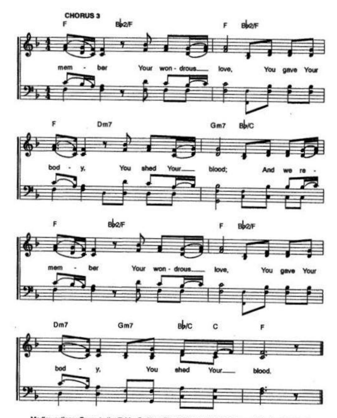
Mediey options: Come to the Table; By Your Blood; Blessed Be the Name of the Lord (MOEN).

© 1991 Integrity's Hosanna! Music. c/o Integrity Music, Inc., P.O. Box 16813, Mobile, AL, 36695. All rights reserved. International copyright secured. CCLI Song # 451177 Used with permission through our Christian Copyright License Incorporated License Number 706121 and Christian Copyright License Incorporated Streaming Plus License 21787152.